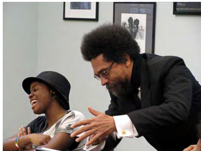
SisterMentors 12th Grader with Professor Cornel West

Then the most extraordinary thing happened — one of the girls gave Professor West a poem from one of her friends who is a big Cornel West fan. He read the poem and then invited all of the girls into his office to call the poet. All the girls piled into his office where he read the poem aloud on the phone. It was quite an experience. His office is like a museum with lots of displayed books and photos of him with celebrities.