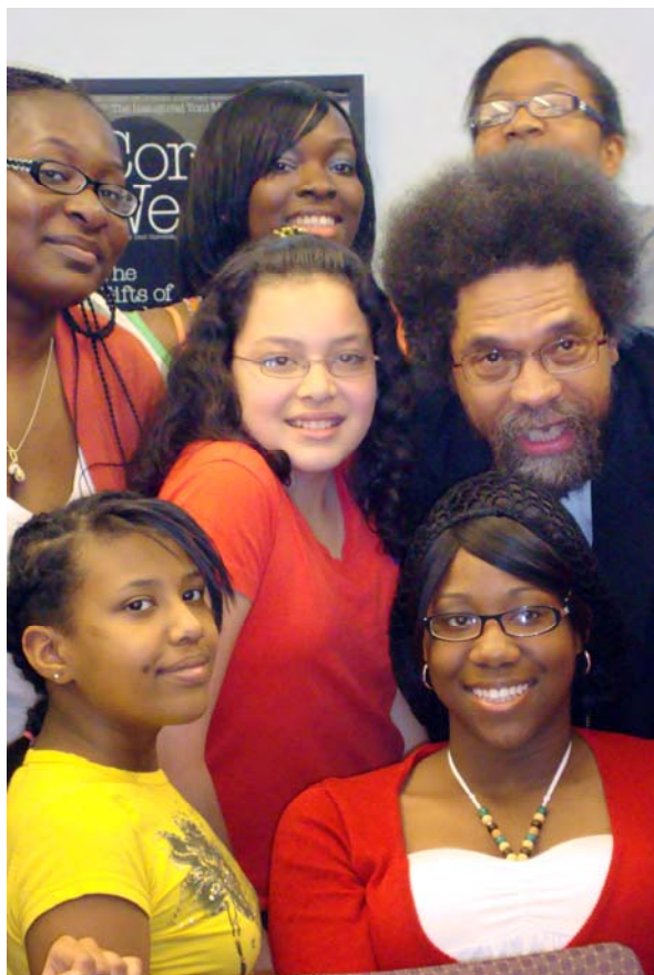
SisterMentors Girls with Professor Cornel West