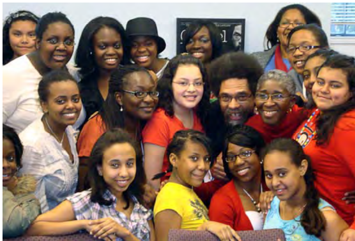
At Princeton University with Professor Cornel West

Located in Princeton, New Jersey, Princeton University is one of the most selective schools in the United States. Its renowned faculty includes Professor Cornel West, one of the