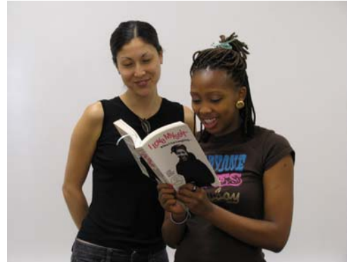
Mentor and Mentee Reading Together

We are seeing that as some of the girls get older, they begin to get jobs to help out their families financially. Last year, one of our eleventh graders worked after school every day except Friday and also worked on Saturdays and Sundays arriving to work at 6 a.m. for eight hours each day. Somehow, she still managed to earn a 3.4 GPA, took a SAT prep class, kept up her role as the president of a club, was a color guard in Marching Band, and volunteered with a facility for senior citizens and with the American Red Cross. She is currently one of our most ambitious and focused twelfth graders.