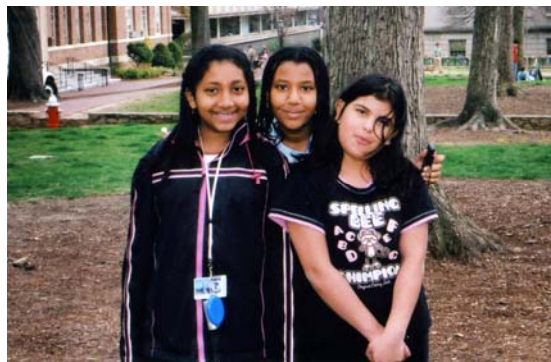
Girls 10 to 12 Years Old on Campus at Carolina

Later that evening girls returned to the Stone Center for a double feature documentary --- two short films, American Red and Black and Unfinished , which both dealt with race and identity. Girls sat with rapt attention as the films unfolded narratives of people of mixed races. American Red and Black revealed stories of people who were both African American and Native American and their struggle to claim their identity and culture. The film Unfinished