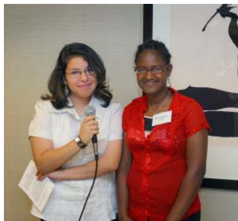
Girls at Our Tenth Anniversary Celebration