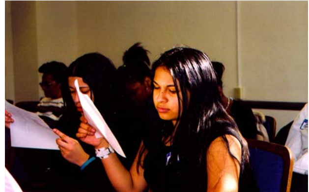
SisterMentors Girls Participating in a UVA Class