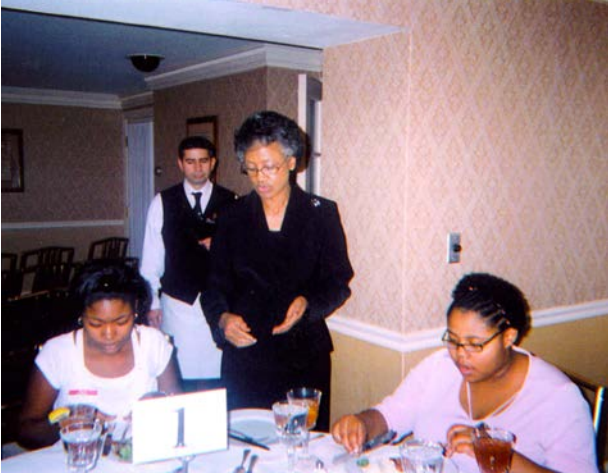
SisterMentors Girls at the Etiquette Workshop