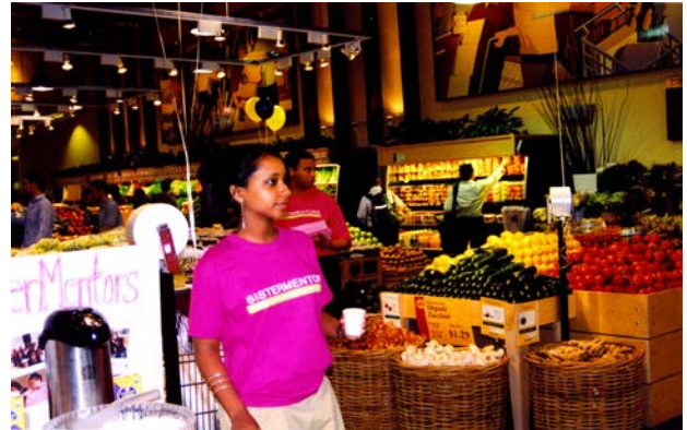
SisterMentors at Whole Foods Market on P Street