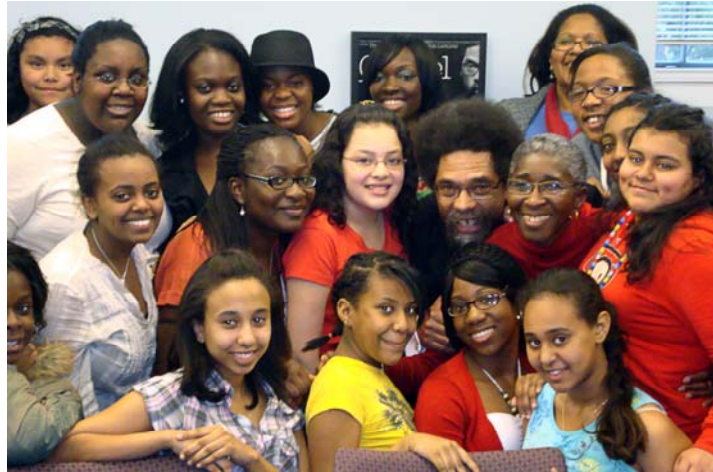
At Princeton University with Professor Cornel West

Located in Princeton, New Jersey, Princeton University is one of the most selective schools in the United States. Its renowned faculty includes Professor Cornel West, one of the