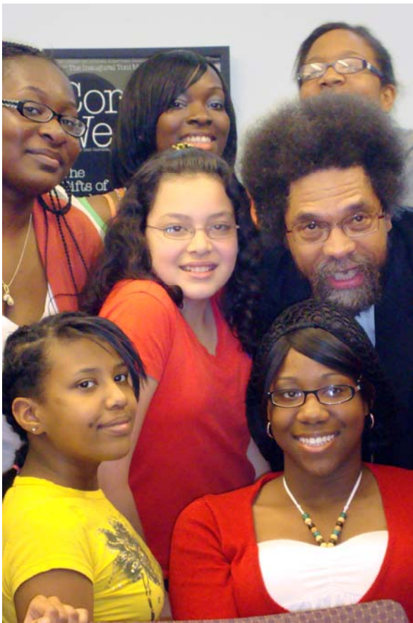
SisterMentors Girls with Professor Cornel West