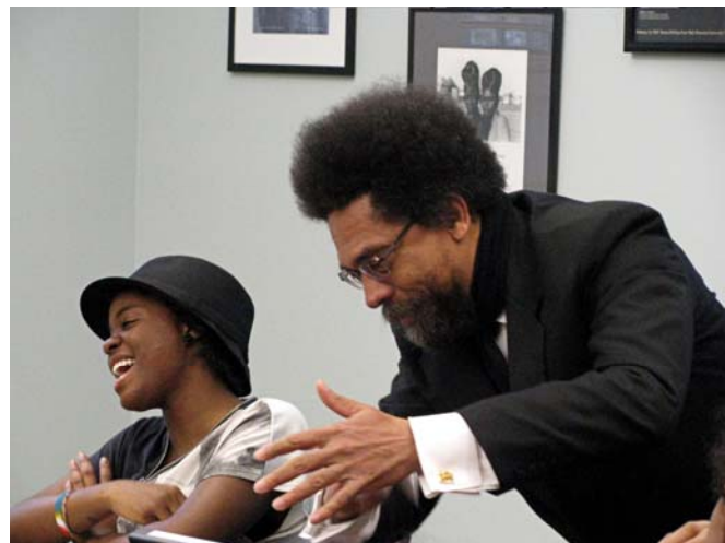
SisterMentors 12th Grader with Professor Cornel West

Then the most extraordinary thing happened — one of the girls gave Professor West a poem from one of her friends who is a big Cornel West fan. He read the poem and then invited all of the girls into his office to call the poet. All the girls piled into his office where he read the poem aloud on the phone. It was quite an experience. His office is like a museum with lots of displayed books and photos of him with celebrities.